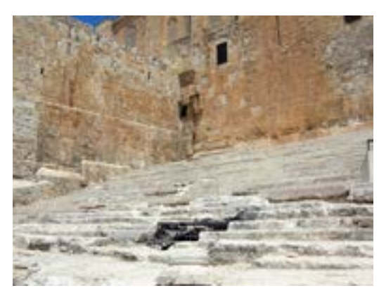
First-century ruins of the Jerusalem temple.