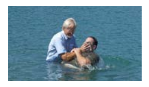
A man is baptised by immersion.