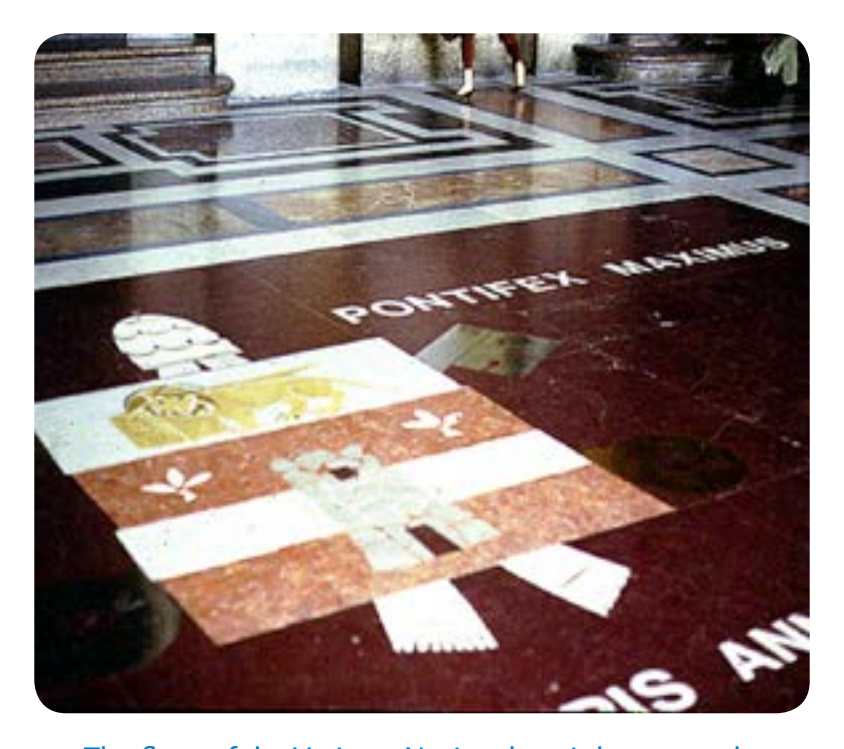
The floor of the Vatican. Notice the triple crown, the winged lion, and the fleur-de-lis.