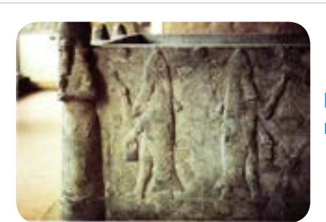
Priests of Dagon in religious garb