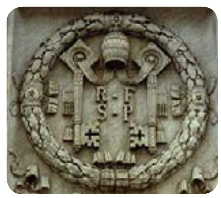
Roman Catholic use of the key symbol in architecture.