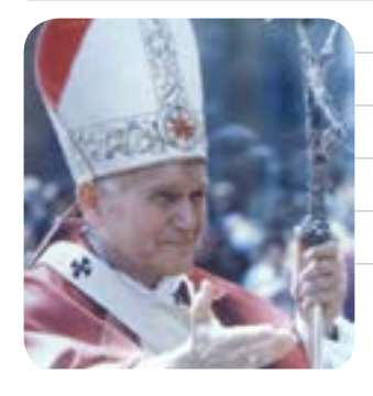
Page 37 of Catholic historian Theodore Maynard's The Story of American Catholicism says this: