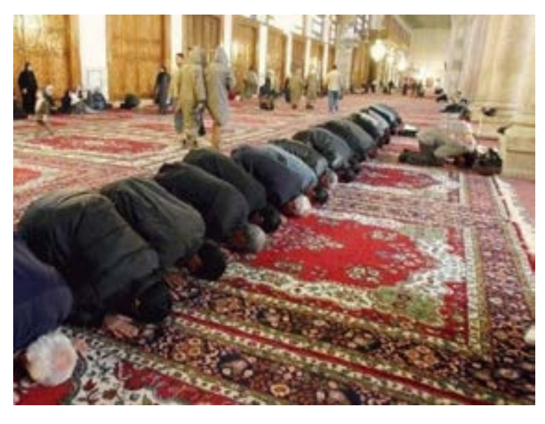
Muslim men praying

Allah is a pre-Islamic name...corresponding to the Babylonian Bel (or Baal).