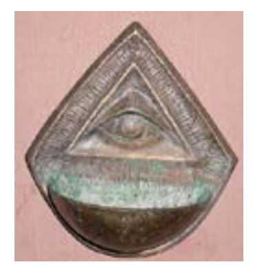
All-seeing eye in Islam (left) and Catholicism (right).