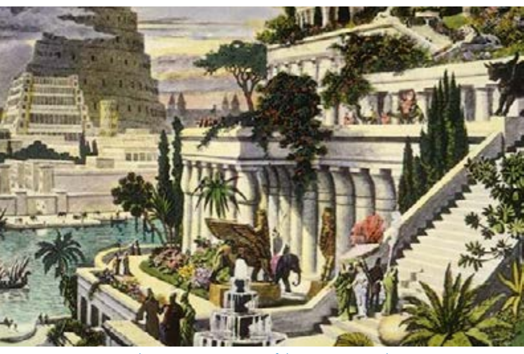
A sixteeth-century engraving of the Hanging Gardens in ancient Babylon, with the Euphrates River flowing by.

41) What does the Euphrates River symbolize? (01:08:25)