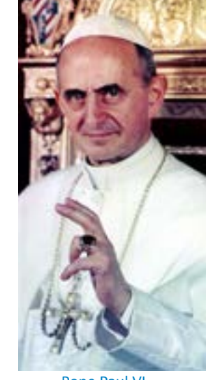
Pope Paul VI

thus establishing progressively a world authority capable of acting effectively in the judicial and political sectors (Pope Paul VI "Toward an Effective World Authority," Popolorum Progression, 78: 1967).